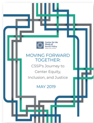
CSSP's journey to center equity, inclusion, and justice .