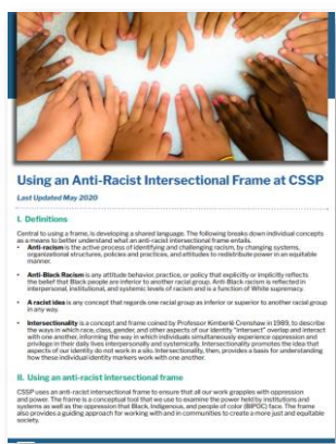
CSSP's Anti-Racist Intersectional Frame